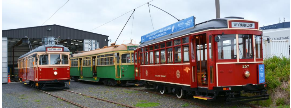
Auckland's Dockline tramway will close at the end of 2022 – 2016 photo by Mal Rowe

UPDATE IS FOR ALL OF YOUR MEMBERS. PLEASE FORWARD IT TO ALL ON YOUR E-MAIL LISTS